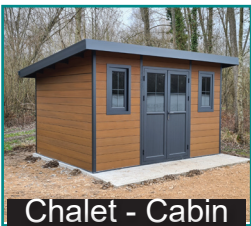
Chalet - Cabin