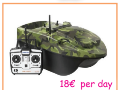
18€ per day

UK SOCKET NOW AVAIL- ABLE ON ELECTRIC POINT