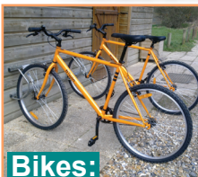
Bikes: 25€ / week